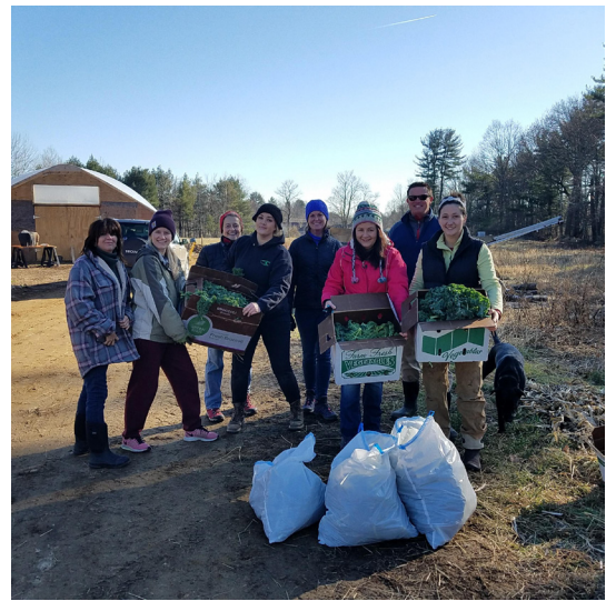
Gleaning from Sanborn Hope Farm in Rochester.

Housed at the Sustainability Institute at the University of New Hampshire, NH Farm to School is a statewide program working to connect New Hampshire farms and schools. As a nationally recognized leader, UNH draws on the Sustainability Institute to act as convener, cultivator and champion of sustainability on campus, in the state and region, and around the world. Learn more at www.nhfarmtoschool.org and www.sustainableunh.unh.edu