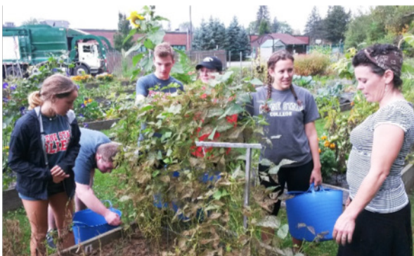
NH Glens works to increase availability of fresh and local produce that is distributed to and through NH food pantries, soup kitchens, community suppers, and schools.