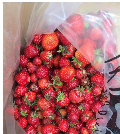
Gleaned strawberries from Work Song Farm and Canterbury Shaker Village in Merrimack County on their way to Salvation Army Food Pantry.

At our agency appreciation dinner last week, one of the 8 beneficiaries of the Morgan Stanley grant of a two door commercial refrigerator told me that since she has gotten the refrigerator AND was hooked up with NH Gleans, she has been able to increase the fresh produce distribution to all her families by 3X what she was able to do before and she said it's all beautiful product and her families have been thrilled to have it.